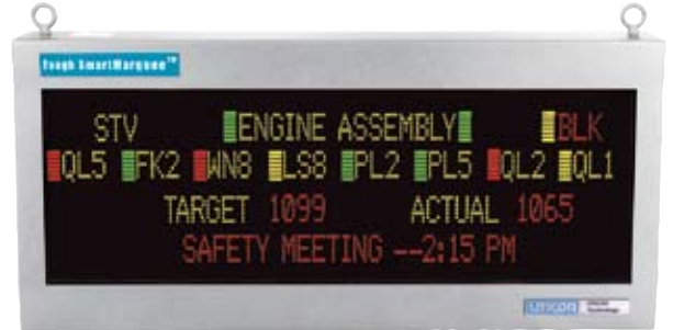
Master Tough SmartMarquee

Control Network e.g. DH+, Ethernet I/P etc. Tough SmartMarquee acts as an Intelligent device on one of the network nodes.