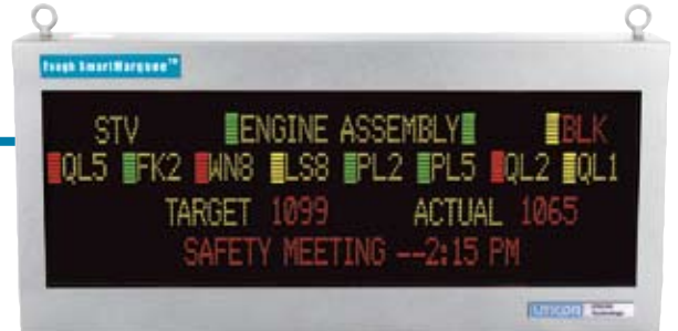
Slave Tough SmartMarquees

IPC with SCADA Software or a Master PLC sending ASCII strings