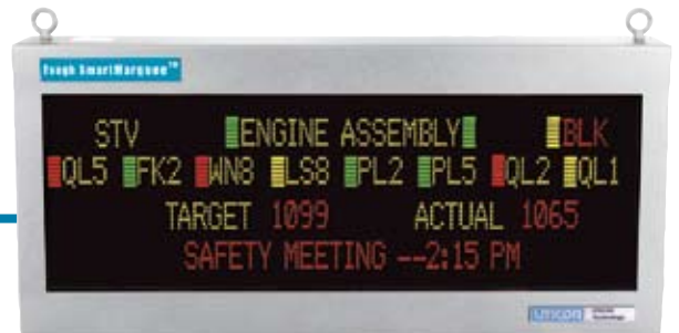
Slave Tough SmartMarquee