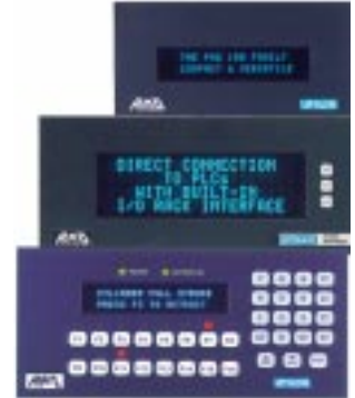
Programmable Message Displays by AVG UTICOR